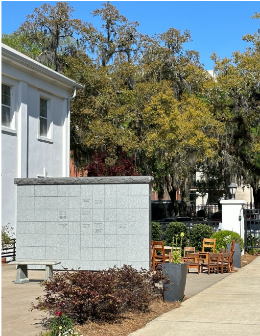
The last action at the church clean out was pulling out these chairs. Free for the taking!

Wednesday, April 17, 6:00 p.m. United Church in Tallahassee, 1834 Mahan Drive