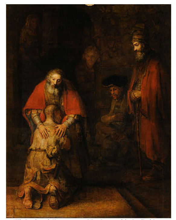
"File:Rembrandt Harmensz van Rijn - Return of the Prodigal Son -Google Art Project.jpg." Wikimedia Commons. 5 Oct 2022, 00:26 UTC. 14 Iun 2024, 15:56