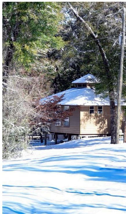
Dogwood Acres after the Great Blizzard of '25

To submit information to be included in the newsletter and/or the Sunday bulletin (as space permits), please use this link , which will take you to an online form. Thank you!